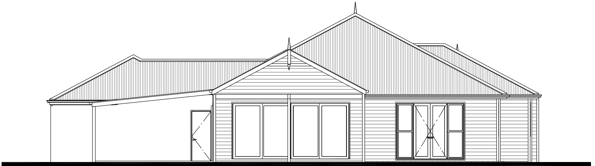
ELEVATION 03 NORTH SCALE 1:100